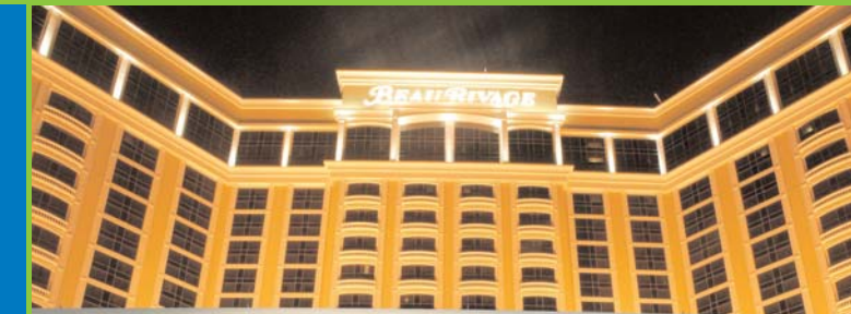
Beau Rivage facade photo courtesy of W.G. Yates Construction.