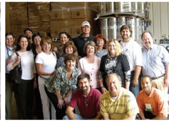
Lazy Magnolia Tour