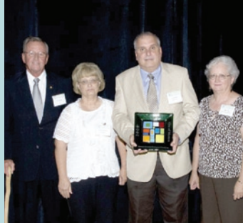
City of Morton