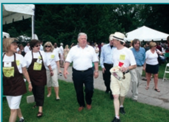
Mississippi Governor Haley Barbour arrives