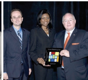
Greater Hattiesburg Area