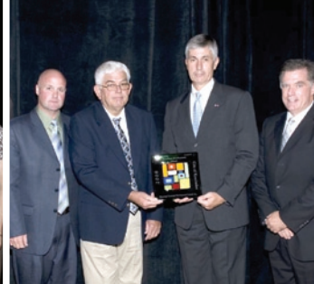
City of Kosciusko