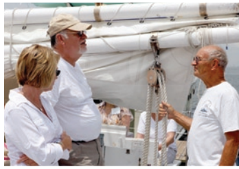
Sailing on the Biloxi Schooner