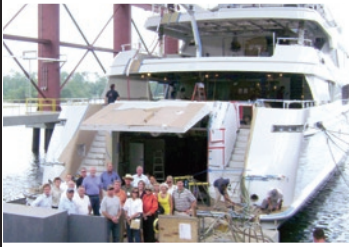
Trinity Yachts Tour