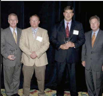
Metal Tech, Inc.