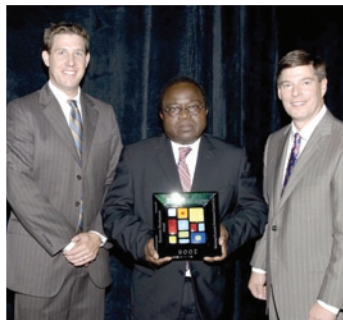
Lee County / City of Tupelo