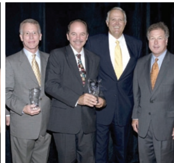
United States Marine